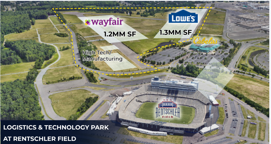
LOGISTICS & TECHNOLOGY PARK AT RENTSCHLER FIELD